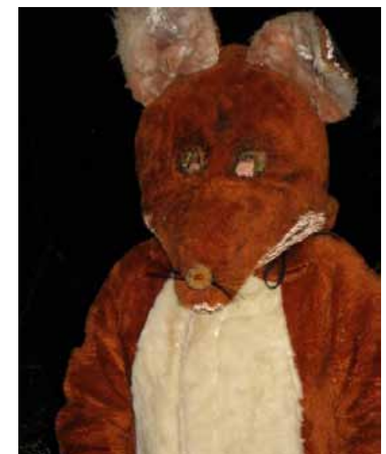
High School Student Volunteer as "The Fox" at the 2010 Westwood Hills Nature Center Halloween Party

Halloween Parties at Westwood Hills Nature Center and the Recreation Center, DECA High School Business Competition, Parktacular, and many other wonderful activities could not happen without the hundreds of people who volunteer every year. Here are numbers from some of 2010 -2011 events and activities: